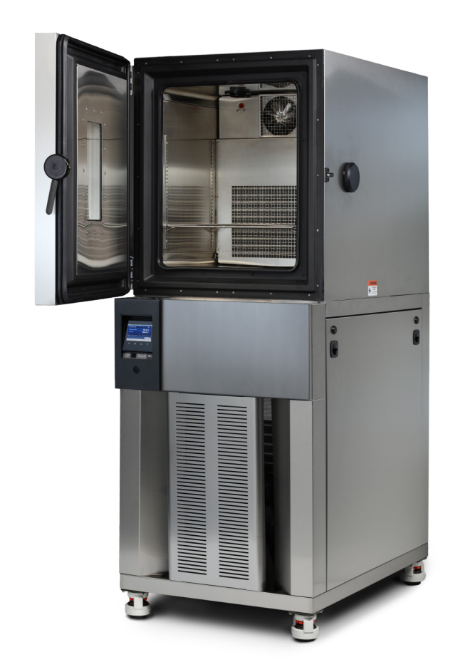
Shown with optional features: window, shelf, cable access port on right (instead of left)